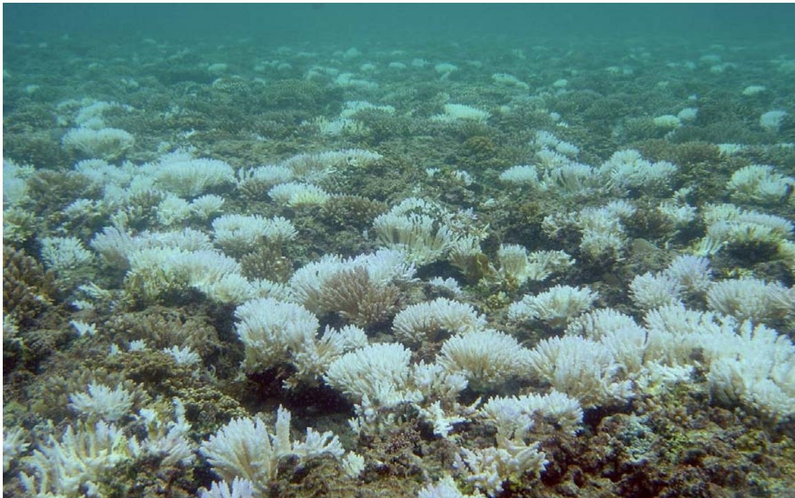
Coral bleaching, Guam